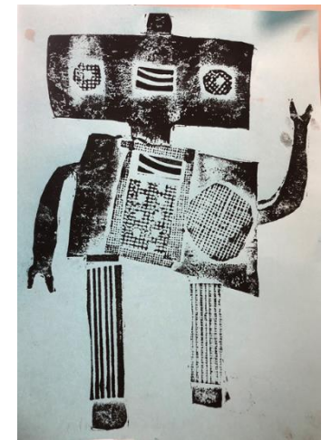
Year 4 : Inventions – robots collage printing.