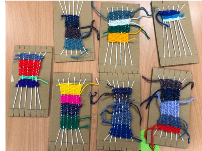
Year 4: Inventions – textiles, card weaving.