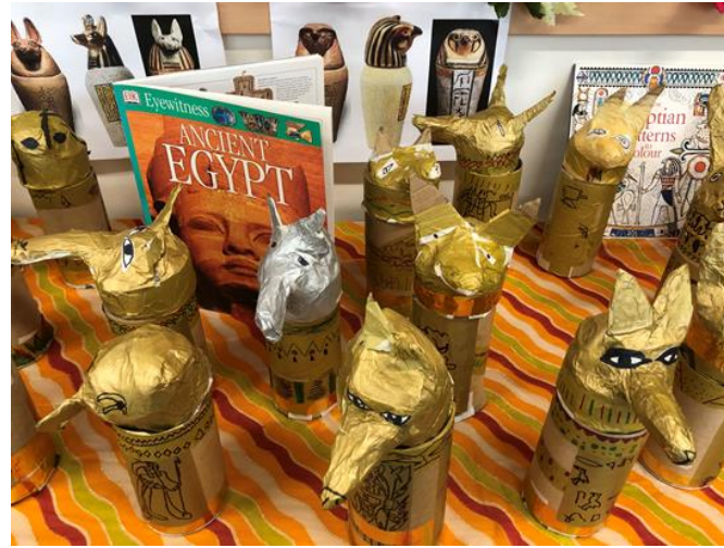
Year 3: Ancient Egyptians – 3D papier mache canopic jars.