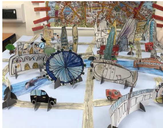
Year 1: London – 3D card construction /cut and slot.