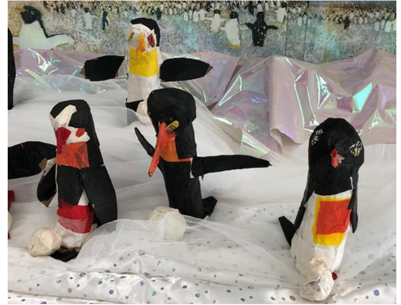
Year 2: Antarctic landscape – papier mache penguins.