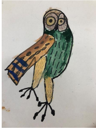
Year 2: Into the Dark – pen drawings with watercolour paint