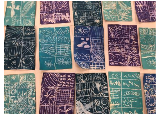
Year 1: Step into Africa - wax resist paintings inspired by adire patterns from Nigeria.