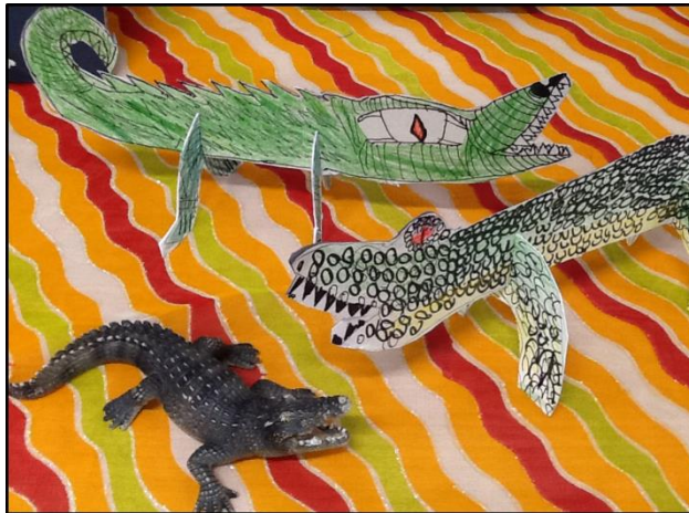
Year 4 : Krindlekrax – 3D card construction / cut and slo.t