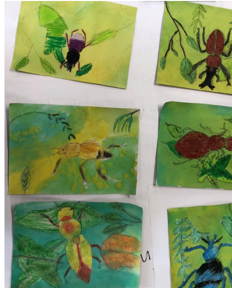
Year 4 Amazonia: Amazon insects- wax resist paintings.