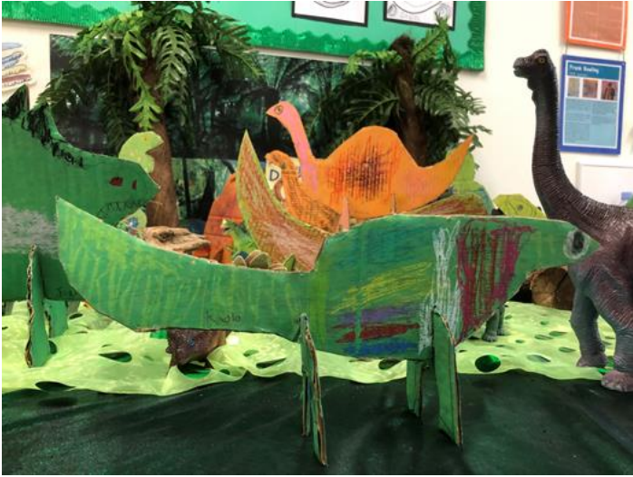
Year 1: Dinosaurs – 3D card construction/ cut and slot.