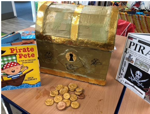
Reception: Pirates – 3D papier mache and salt dough coins.