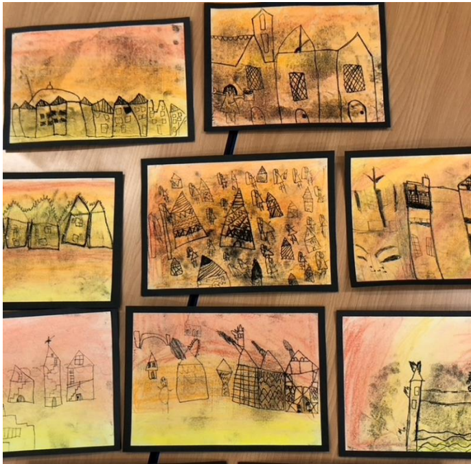
Year 2: Fire! Fire! – mono printing on to chalk pastel backgrounds.